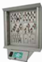
Key access locker systems