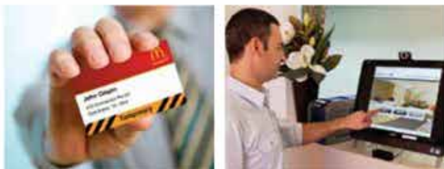
Branded swipe cards used to quickly sign in.

There are many systems in the marketplace that provide on site sign in, but Rapid Access Systems provides so much more than just access. The system links with other Rapid Global products such as Rapid Induct and Rapid Contractor Management to provide a comprehensive picture of the compliance of both the individual worker and their company. Only fully compliant workers from compliant companies are provided access to enter the site.